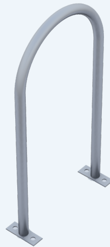
BikeRib-1.5-SM-BH 1 Bike, Surface Mount, Polyester Powder Coat Black Hammer

The Bike Rib is available with either surface mount or in-ground mounting options.