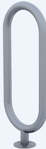
Oval-SM-BH, 1 Bike, Oval, Surface Mount, Powder Coat Black Hammer