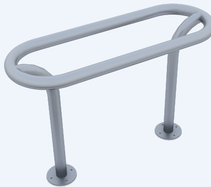
TrakRack, 2 Bikes, Surface Mount, Polyester Powder Coat Black Hammer