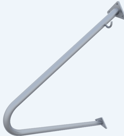
Wall Mount 2 Bikes, Surface Mount, Polyester Powder Coat Black Hammer

Simply stand the bike up, hook the front wheel, and let gravity take over – the bike rests into place. No lifting required and the bike is not suspended so there is minimal weight on the front wheel. This vertical bike rack allows the user to U-Lock for REAL bike security! Designed for indoor and outdoor bike rack parking This vertical bike rack is utilized in Bike Rooms, Commercial Parking Garage, Residential Garage or where organized bike rack parking and bike rack security is needed.